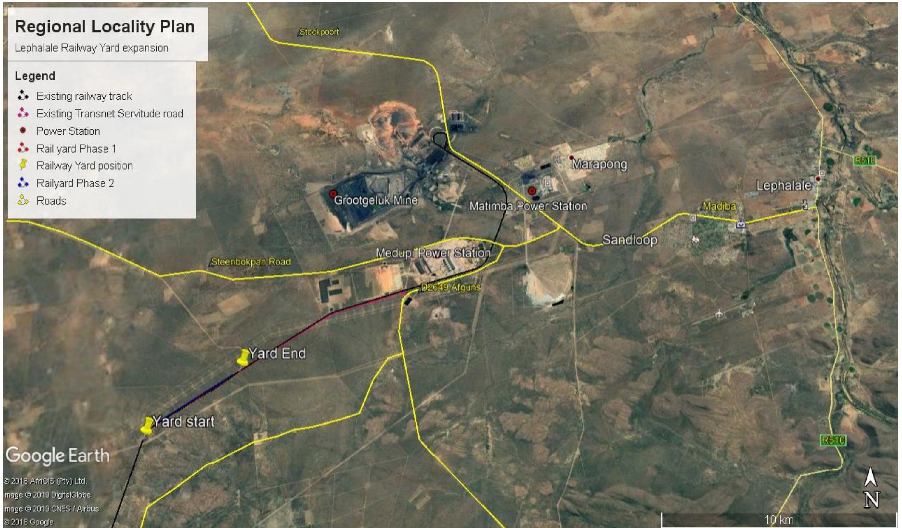
APPENDIX 1C: Regional Locality Plan 1.1